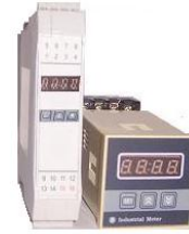
transmission unit E/F

The sense 2060 is an advanced, state-of-the-art, two-wire, Capacitance-based level transmitter suitable for a wide range of process applications. This level measurement solution is suitable for both high temperature and causticity liquids/solids. The level gauge system consists of an explosion proof housing, field-replaceable electronics module, and level measurement probe/sensor. Common industrial scurviness applications include the measurement of liquid hydrogen, liquid oxygen, solid powder, acid, oil/water interface and others. The latest in microprocessor technology allows the level transmitter to consistently and reliably measure the level of your process fluid.